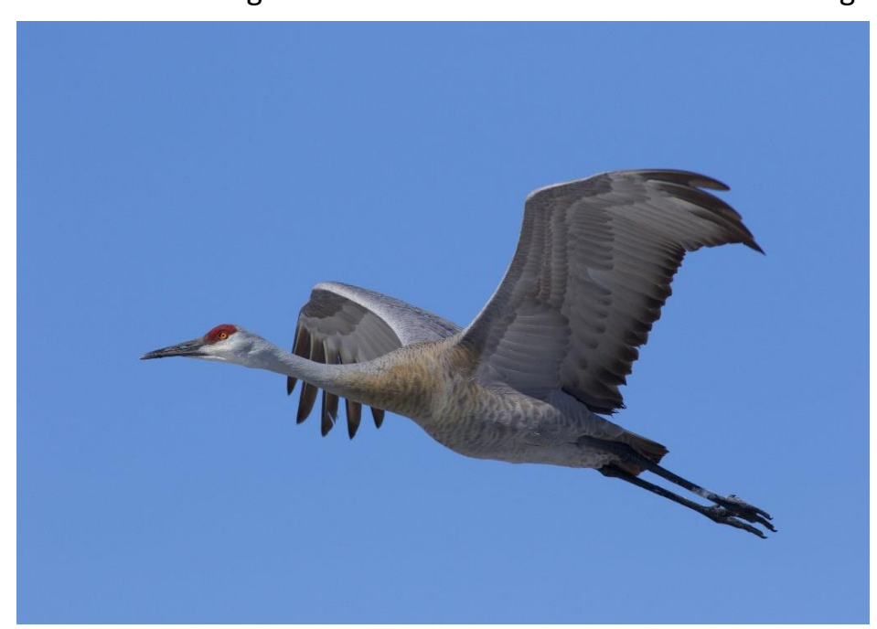
Sandhill Crane. Arlene Koziol

A few days later, on January 13, Graham counted 640 sandhill cranes flying high over Goose Pond, also heading south-southeast. Both observations occurred between major snowfall events. According to the UW Farms weather station in Arlington, we received six inches of