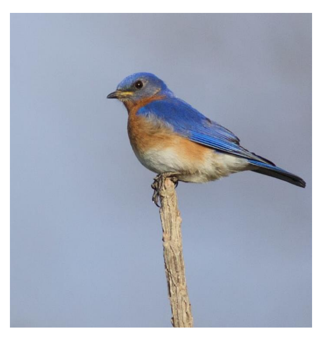
Eastern Bluebird. Arlene Koziol

On December 21, observers spent 51 hours counting birds over 417 miles, which yielded 54 species and 4,815 birds. This was an unusually windy CBC (low 20 mph, high 34 mph) with cloudy skies and light snow in the morning; there was a trace of snow on the ground, and both still and moving water were partly open. High counts included 100 Lapland Longspurs, 47 Common Mergansers, 58 Bald Eagles, 9 Redheaded Woodpeckers, 3 Northern Shrikes, 28 Eastern Bluebirds, and 8 Red Crossbills. Thank you to all the volunteers who helped count, as well as Brian Doverspike for coordinating the Pardeeville CBC since 2017. Goose Pond staff and volunteers assisted with five out of eleven count areas.