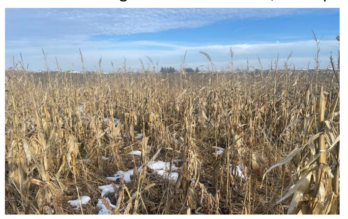
Weedy food plot. Graham Steinhauer

Winter birds found at Goose Pond in the food plots and prairie during the 2023 Poynette CBC included 66 Ring- necked Pheasants, 1 Cooper's Hawk, 4 Northern Harriers, 2 American